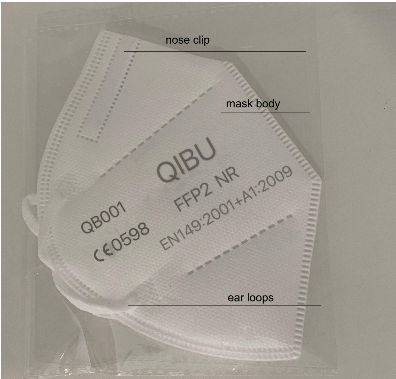
Figure 1 Structure chart

2.1 Product picture and structural information